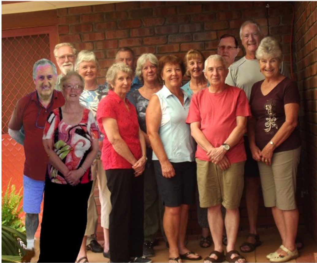
Committee Members Southern Districts Computer Users Club, 2017