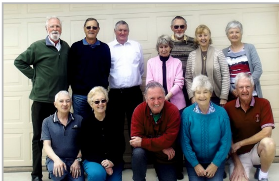
Southern Districts Computer Users Club Inc. Committee 2017-18

Their commitment to their respective duties and details to their responsibility require our gratefully thanks