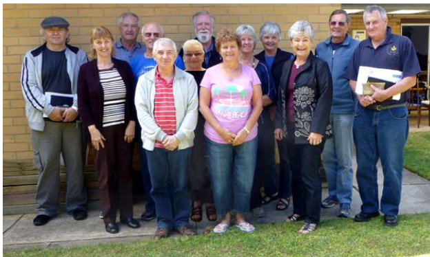
2013-14 Committee Members