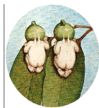
Editors: Bib and Bub

We hope you are all managing to keep cool during these mini heat waves.